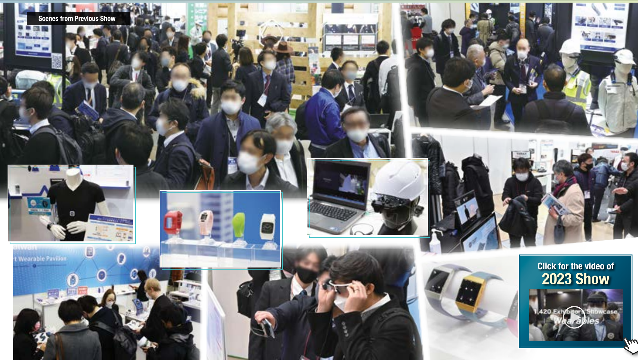
Scenes from Previous Show